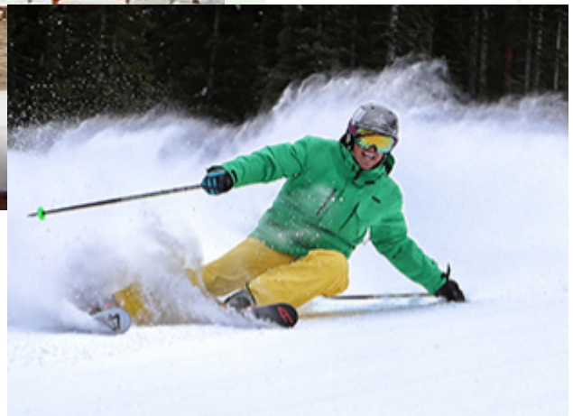
Copper Mountain Skier