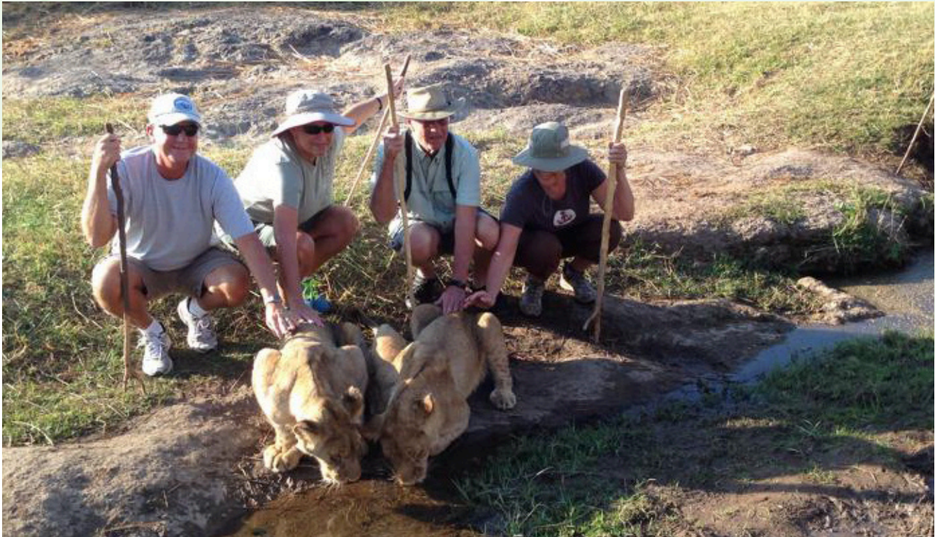
Petting lion cubs - Kariega Game Preserve