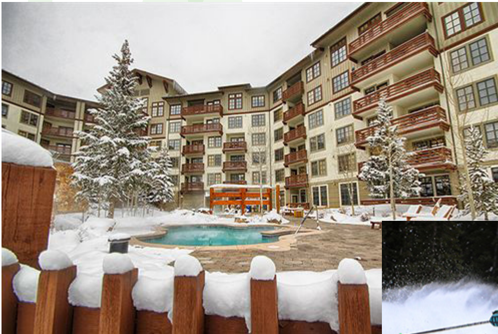
Copper Mountain 2 Bdr/2 Bath Condos

If we get 5 kids aged 14 and under, we qualify for the Youth Foundation offer of $50 off of ski or snowboard lessons each day up to four days!