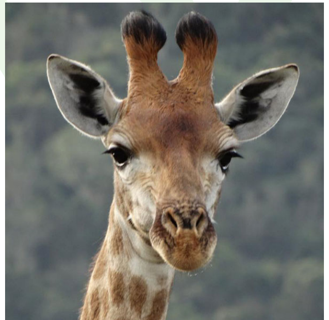
Giraffe, Kariega Game Preserve

After our long flight to Johannesburg followed by a short flight to Port Elizabeth, we bused out to Kariega for our first safari. It was so incredible to be able to see the animals in their nature habitats. Some of our best experiences were just sitting and letting nature take its course. Hopefully, you've seen all the pics on our club Facebook page. Each evening, we enjoyed sun-downer drinks out on our safari before heading in to dinner and entertainment.