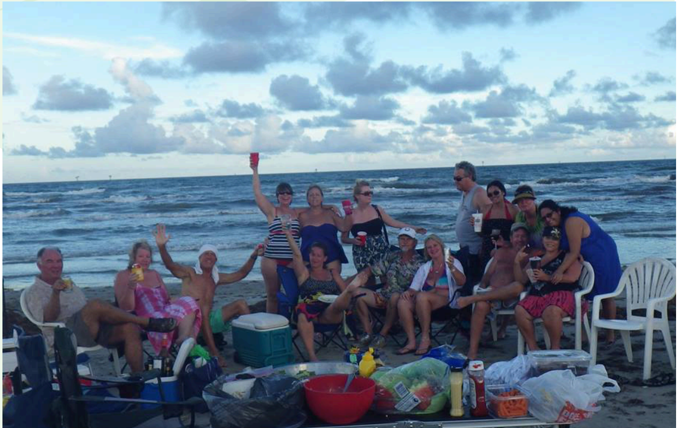
Saturday night beach party