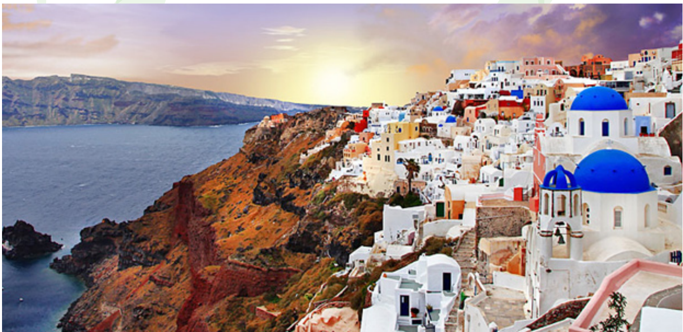
Santorini, Greek Isles