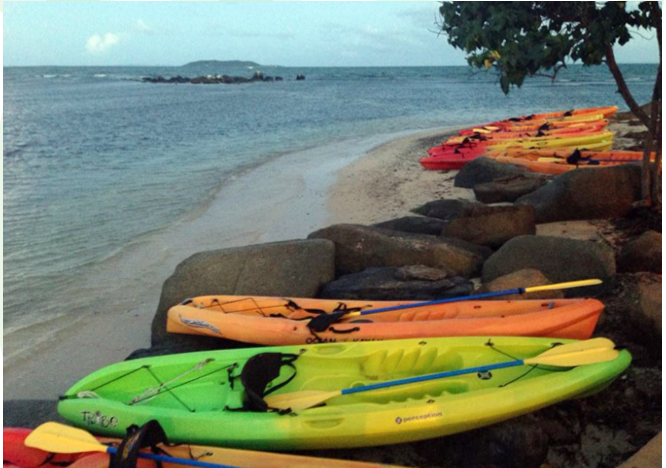
Our kayaks await us in the bay of Fajardo

rings attached to the backs of each kayak. Now for the good part. Emerging onto the lake, Laguna Grande, the sky was beautiful to behold. And coming back we were swept along with a current, so - less struggle, more coasting. I thought to myself what a hardy group we were to have hiked a rainforest and kayaked through a mangrove swamp in one day. Exhausted!