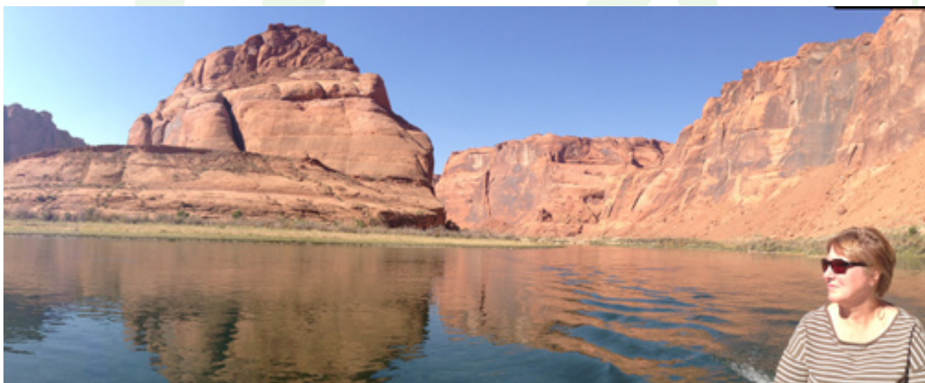
Debbie on the river float trip

We've returned to Dallas with many new friends and lots and lots of wonderful pictures. This trip was truly the most wonderful red rock tour!