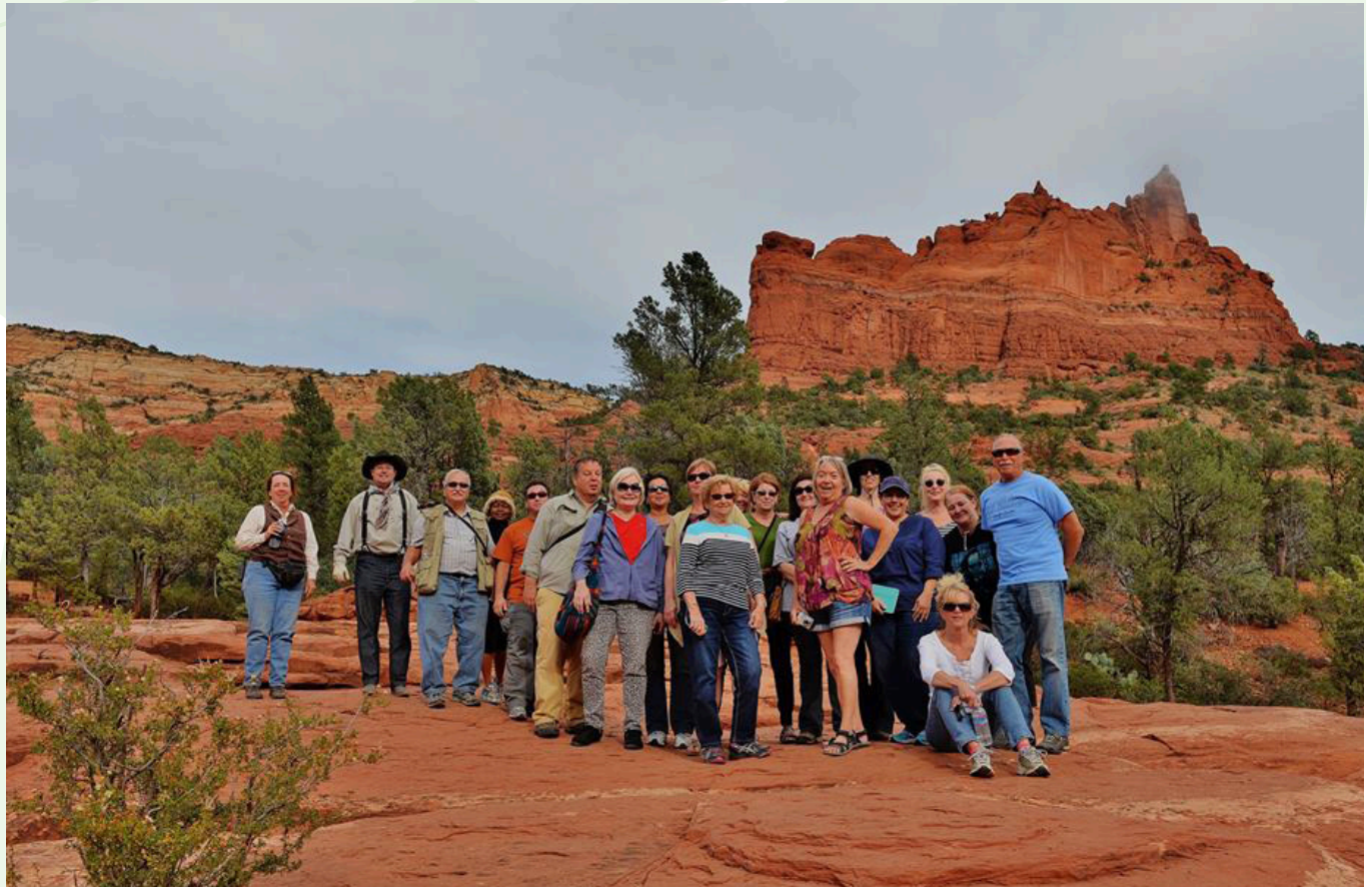
Red Jeep Tour group shot in Sedona