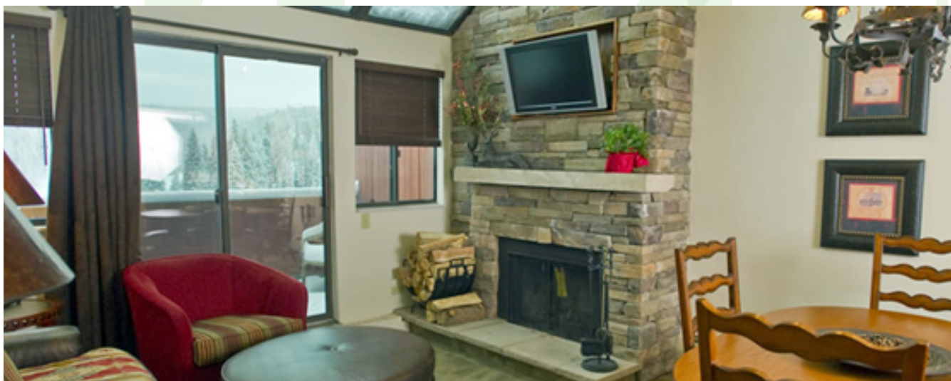
Beaver Run Resort