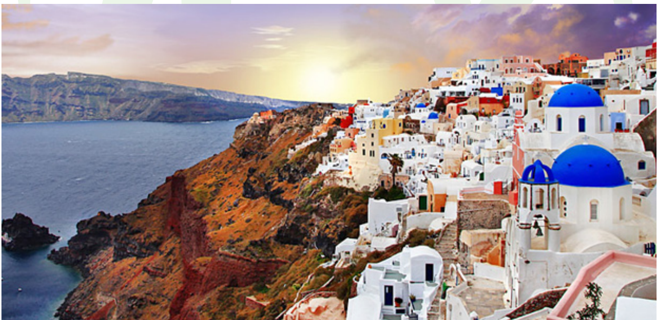
Santorini, Greek Isles