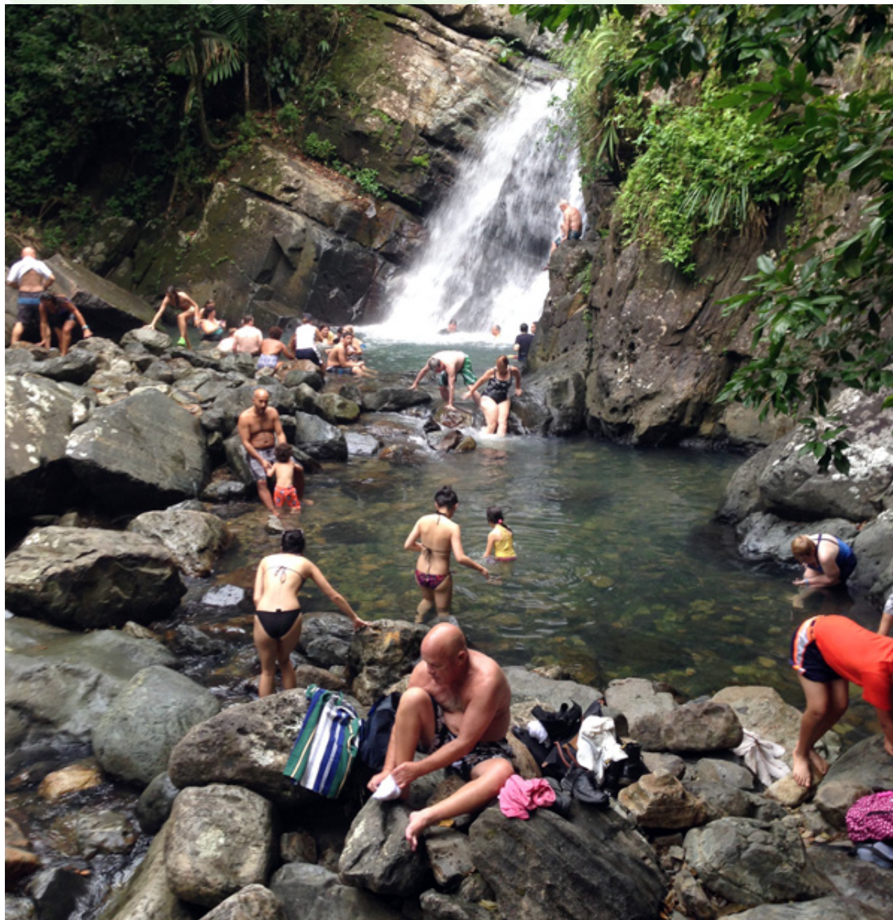
La Mina Falls in El Yunque rainforest

just enough surf to make you want to stand in it and splash with each incoming wave. A small coral reef was visible. Several of us swam there and snorkeled. Lots of coral types: brain, fan, branch, and small fish were seen. The beach was lightly populated and I looked for Gilligan and Mary Ann but saw no trace of the S S Minnow.