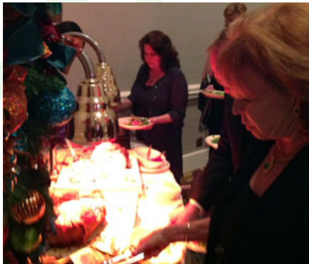
Dinner at the Omni