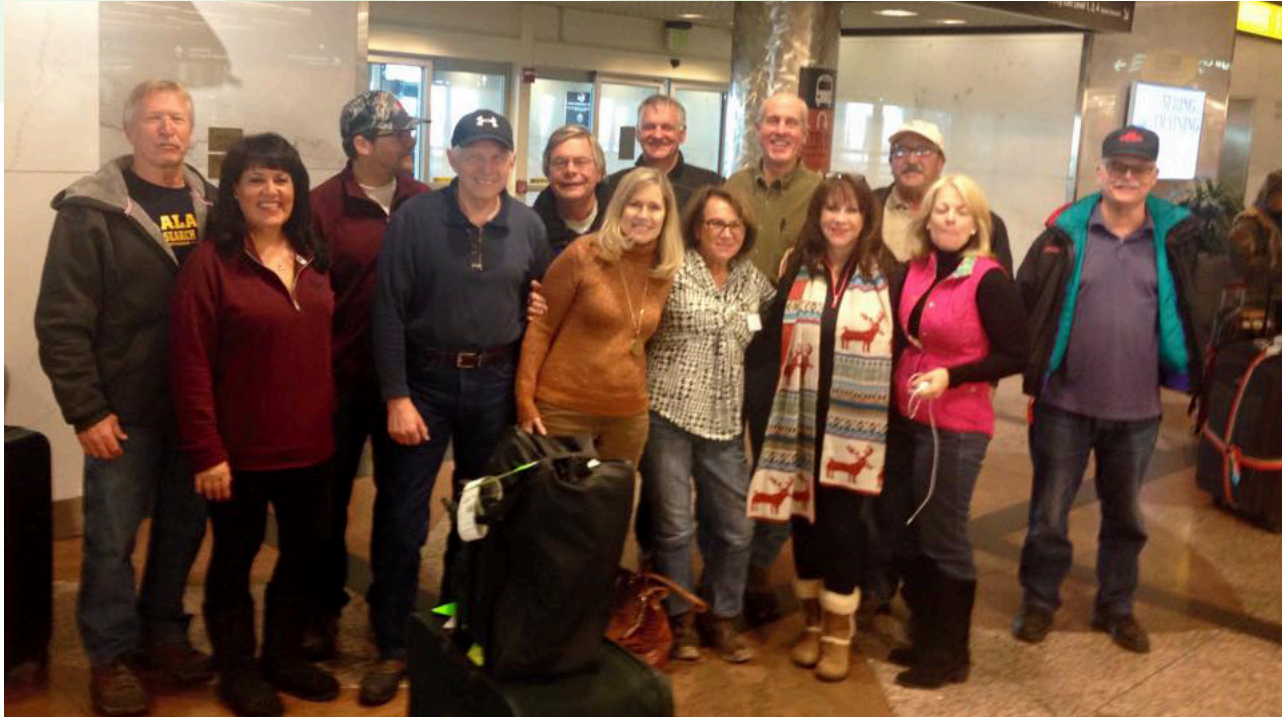
Beaver Creek ski party