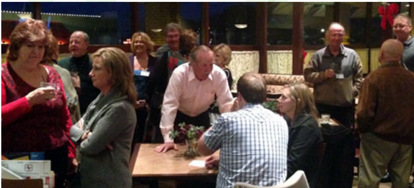
Listening, talking, laughing and most of all drinking characterize our LSS Happy Hours.