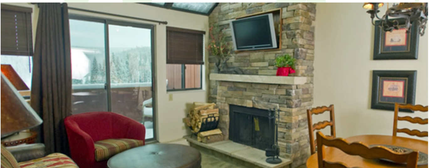
Beaver Run Resort

NOTE: Southwest Airlines is currently running $113 round trip specials. For those traveling on the 7 night trip, we can transfer you to Breckenridge for an additional $54 if you fly the same flights as the main group (contact debbierima@yahoo.com for that info). For those not traveling with the main group or on the short trip, there is a shared ride shuttle to Breckenridge for $123+tip round trip.